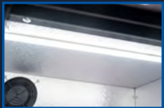
Internal LED Illumination