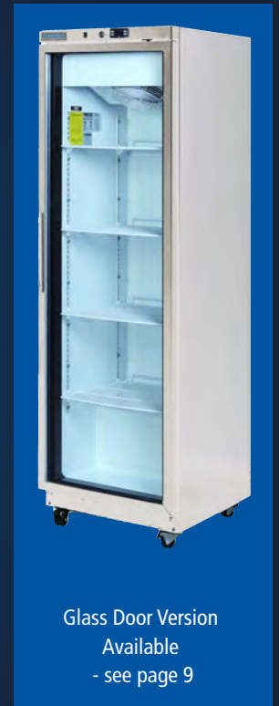
Glass Door Version Available - see page 9