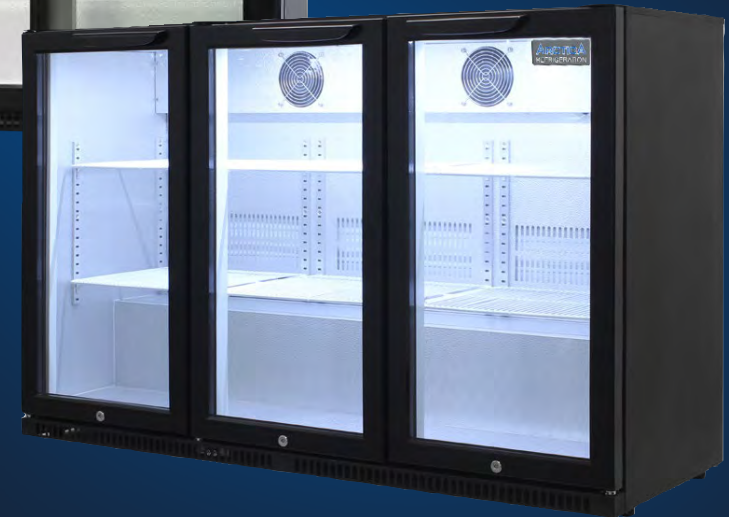
HEF969 - Hinged Door model