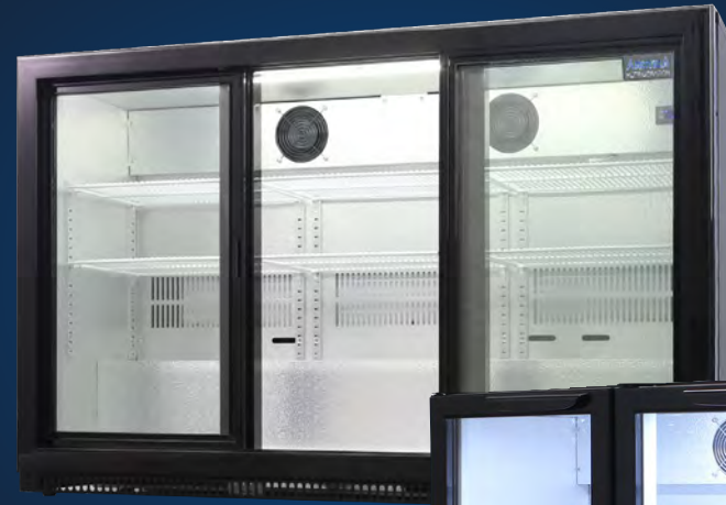
HEF970 - Sliding Door model