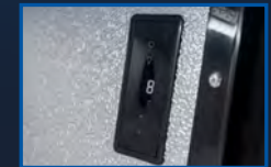
Internal Digital Display and Temperature Control