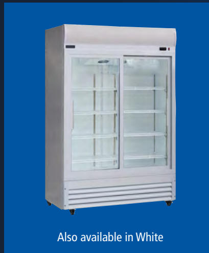
Also available in White