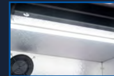
Internal LED Illumination

HEC818 Standard Height - Sliding Doors, Capacity up to 262 x 330ml bottles - 865 x 512 x 892mm