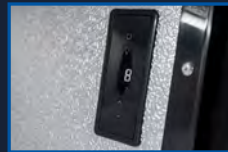
Internal Digital Display and Temperature Control